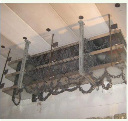
Fire resistance test according to prEN 50577 standard