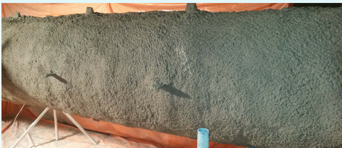
Element with applied fire protection based on the FEM heat transfer analysis

Each situation has its own most suitable solution. The Efectis analysis method, using the heat(-stress) analysis, gives all needed information to evaluate the fire resistance and if necessary find the best protection of a structural element. Optimising the fire protection leads to a well-considered and supported decision and chosen risk level.