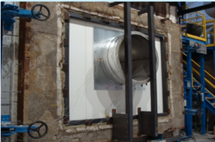
Penetration through a bulkhead

If a performance is required of a deck or bulkhead, the same is required for doors, windows or penetrations in this division. We can test these for you, and advise you with regard to the design test set-up and process.